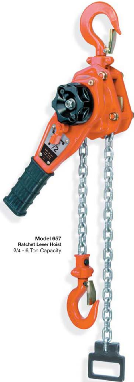
Model 657 Ratchet Lever Hoist 3/4 - 6 Ton Capacity