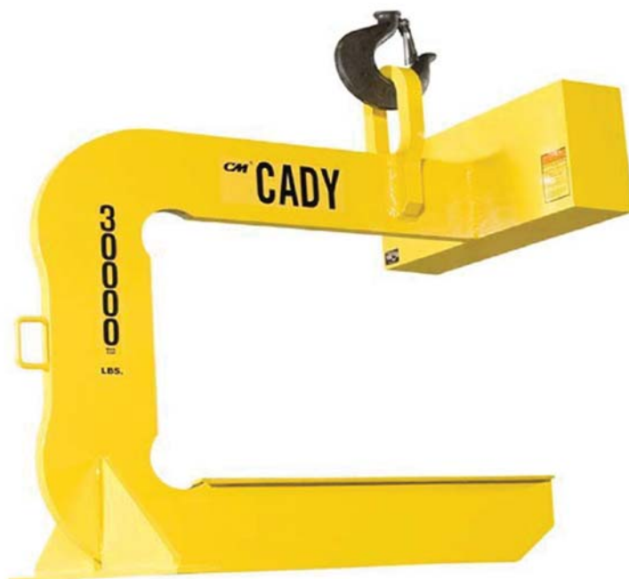
Capacity 5 to 50 tons

Ship Loaders – Designed for use with slings to handle two coils simultaneously. Hooks are easily separated for insertion into coils.