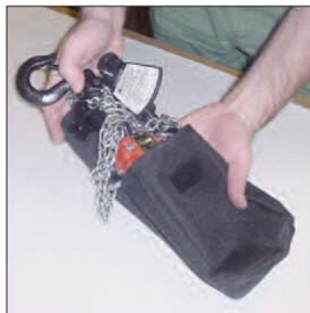
Convenient Carry Bag - Product Code # 0212

Our compact Mini-Hoists perform just like the larger hoists, except they're small enough to fit in the palm of your hand.