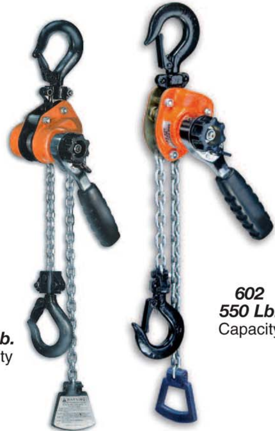
603 1100 Lb. Capacity