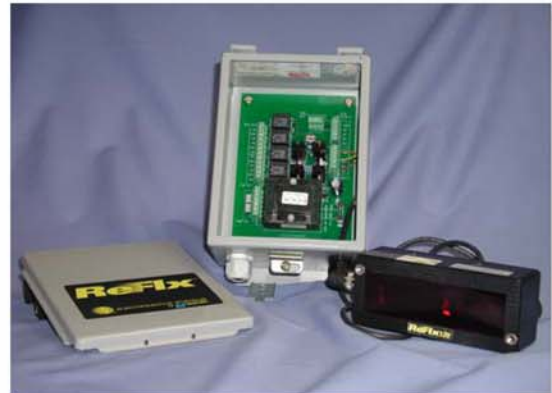
ReFlx 120 (reflector not shown)

The ReFlx 120 System features a two-channel infrared sensor, which can be adjusted to give separate outputs for each channel at distances from 20 to 120 feet. The most commonly wired configuration is the use of one channel to provide the primary stop command to the motion control, while the second channel is used as a redundant stop command.