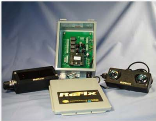
ReFlx 120 "Plus" (reflector not shown)